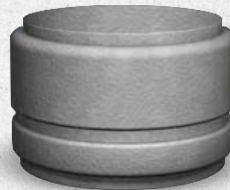
• NEWAVEA 510R-LOW