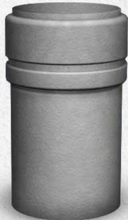
• NEWAVEA 510R-HIGH