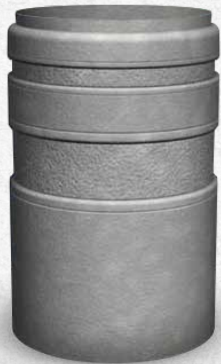
• KELLAMY 610R